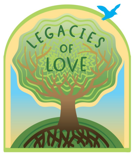
UNITARIAN UNIVERSALIST CONGREGATION of ROCKVILLE CANVASS 2019