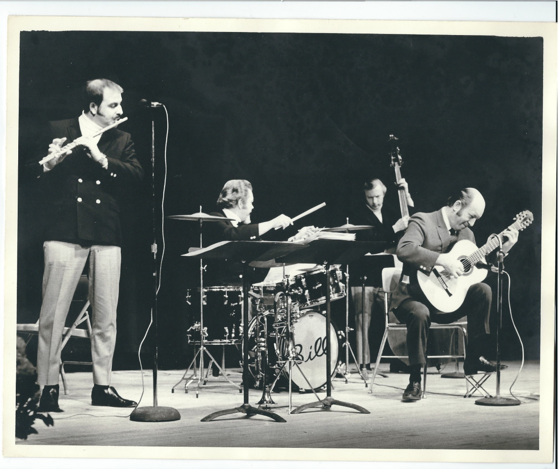
Charlie Byrd concert benefiting UCR, January 1969, Montgomery College.