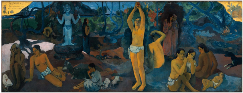
D'où Venons Nous / Que Sommes Nous / Où Allons Nous by Paul Gauguin

(Worship Services continued from page 1)